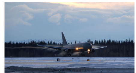
Aircraft assigned to the 354 th Fighter Wing and 168 th Wing park in formation on Eielson AFB (top). Due to Eielson AFB's location, the base hosts many visiting aircrews that come to conduct cold-weather training, such as the 931 st Air Refueling Wing with this KC-46A Pegasus (bottom).